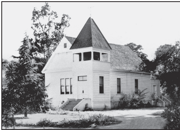
Third School 1930's

A new school was built in 1893 nearer the road than one built in 1871. The older building was moved in 1922 to the south side of the road to Oakland by the Lafayette Improvement Association to be used as the post office, telephone central and the library. It is still there [as the Red Wagon shop] behind a new façade. The school board bought lots across the road and built the current Lafayette Elementary School . The school house and lot was sold to the church. The building was remodeled for their use and eventually incorporated within the present