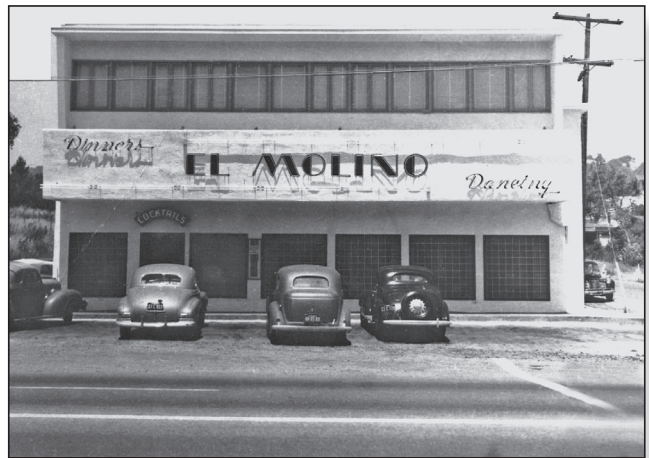
El Molino Restaurant