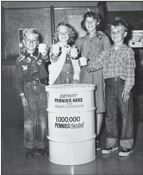
Deposit Pennies Here

Is this you? Is this your Dad or Mom? Maybe your Grandpa or Grandma!