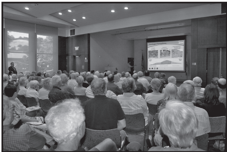
Fourth Bore presentation