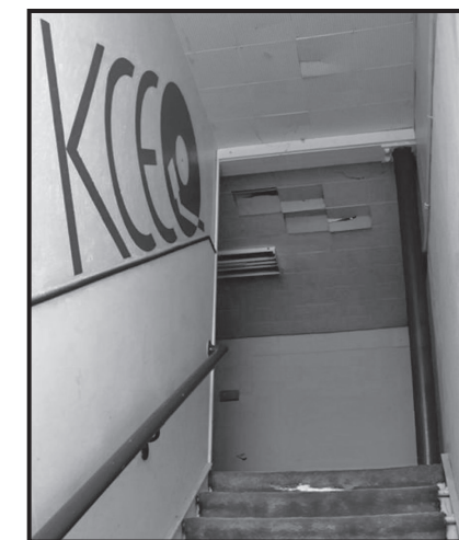
Room 501 the Home of KCEQ