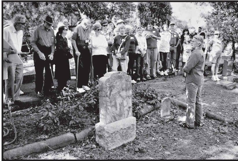
October Cemetery Tour Participants

In October we presented two very successful programs about Lafayette's Historical Cemetery – more than 40